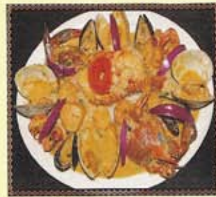
Combinacion de Mariscos