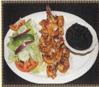
Camarones a la Plancha

Beef with chili sauce - $7.25 Chicken with ranchera sauce - $6.95 Vegetables with green sauce - $5.95 Beans with ranchera sauce - $6.95